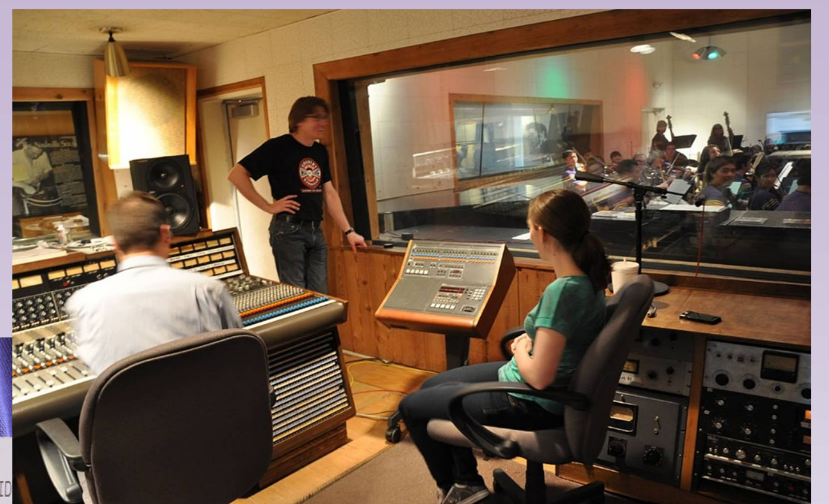
Gold Orchestra recording session, Studio B, (Elvis' favorite recording studio), Memphis, TN, June 2012